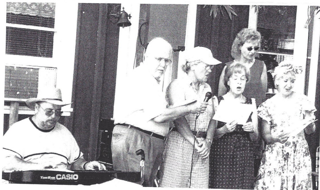
Monitor's Midsommar Melody-makers