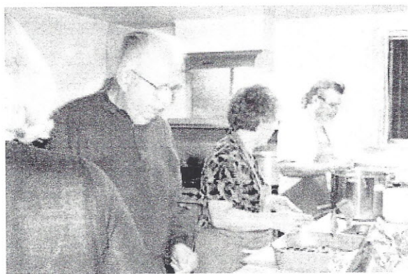
Our Souper Chefs provided Ärtsoppa och Pankakor to please our palates.