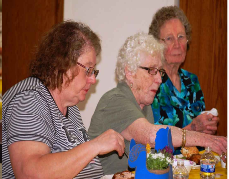
TACK FÖR MATEN TEAM 3 GREAT BBQ CHICKEN TEXAS NETZEL STYLE!