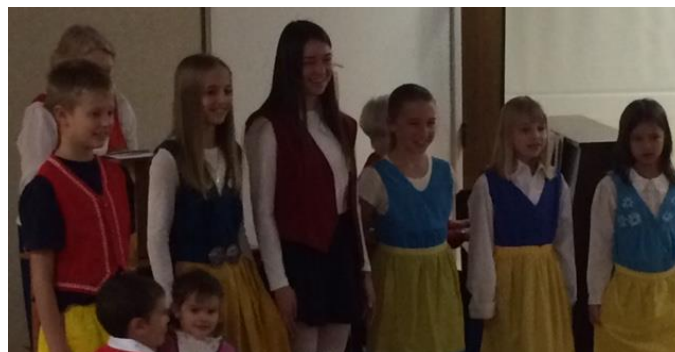
Monitor Lodge children's choir in traditional costume

January 2016 Meeting. The Lodge will kick-off 2016 on Jan. 8 with the installation of officers. The good news is that the new officers will be cooking dinner. This should be interesting! It starts at 5:30 p.m.