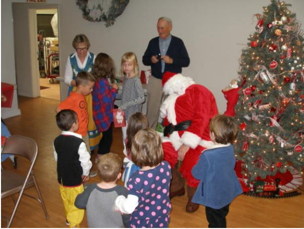
Lucia 2016 - Santa, helpers and children