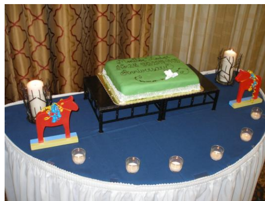
Anniversary cake and Monitor-made Dalahäst table decorations