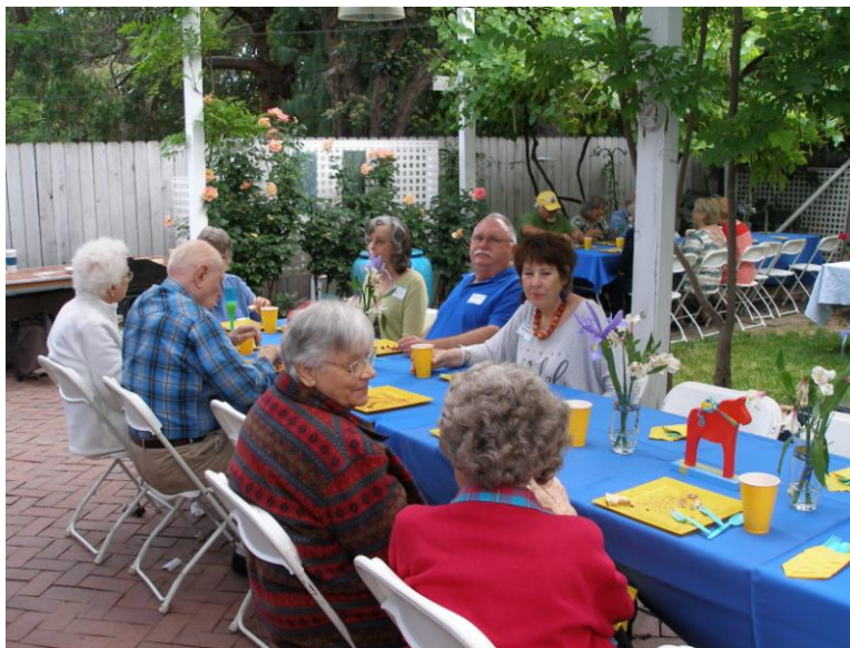
Dalahäst, roses, Swedish colors and satiated members and guests enjoying the mid-70s weather