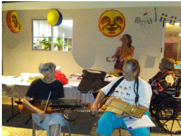
A nyckelharpa duet