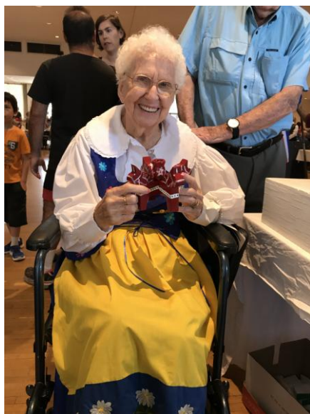
Violet spreading good cheer