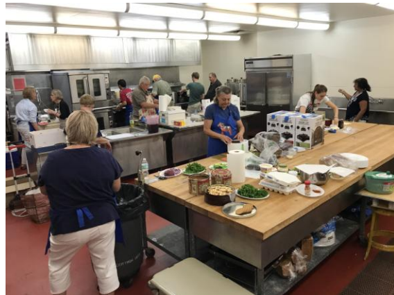
The kitchen crew about 9:00 AM