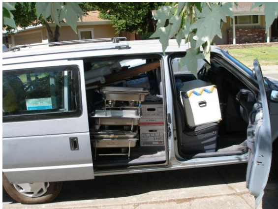
Chuck's van (load 1 of 4)