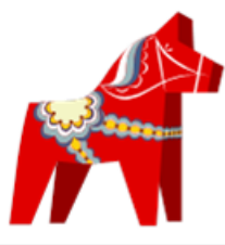
Monitor Lodge Website