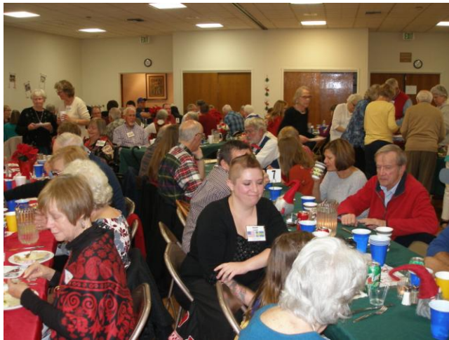
Some well sated members and guests.