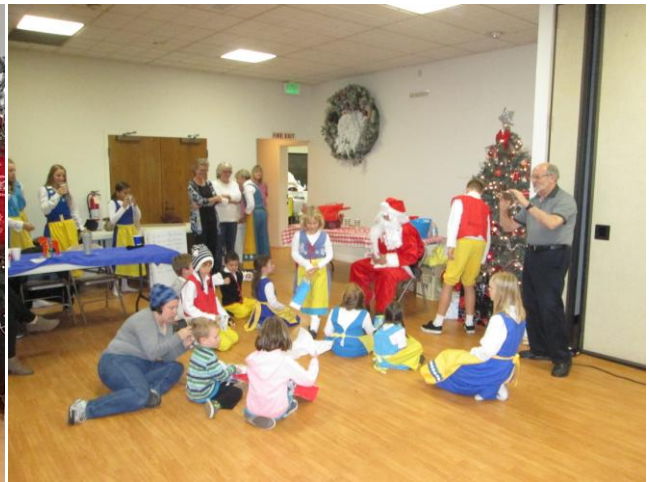
Santa and the children