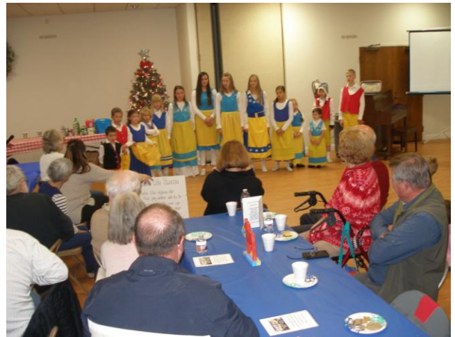
Monitor Lodge's youth dancers and carolers