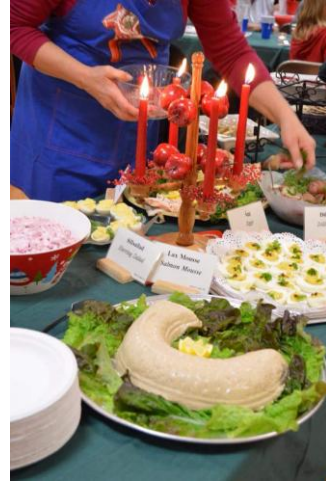
Julbord 2017 - We were not sure if we would have enough food 😊😊