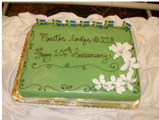
Another Ettore-made Princess Torta