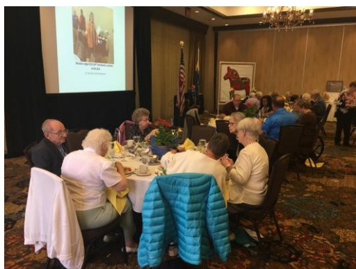
Enjoying the slide show, good food and good company