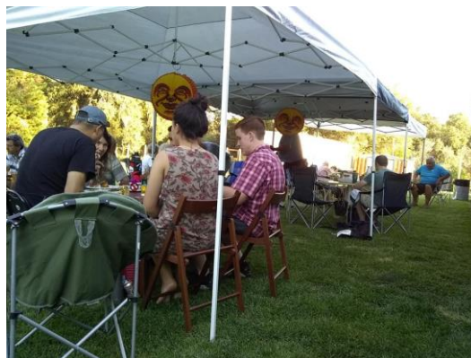
Everyone focused on the food