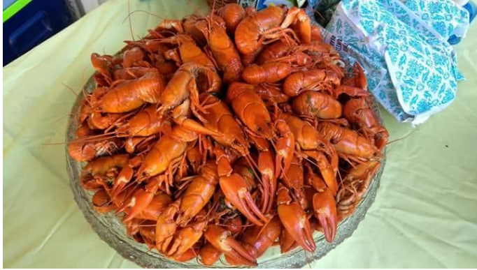
Kraftskiva (1)- August 4, 2018

Sacramento, California Meets at I.O.O.F. Hall, 1831 Howe Ave