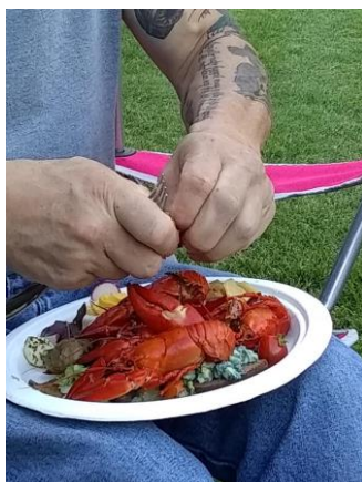
Just another happy member