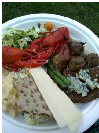
Karftskiva - August 4, 2018