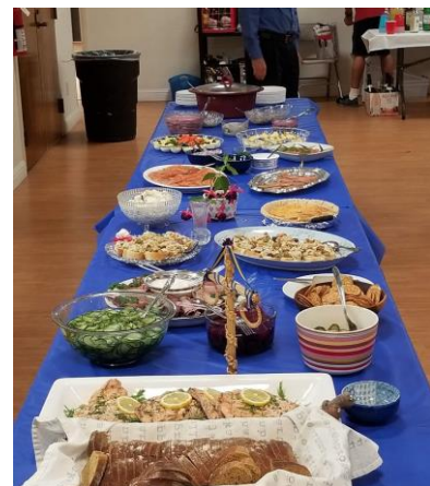
Just some of the Smörgåsbord