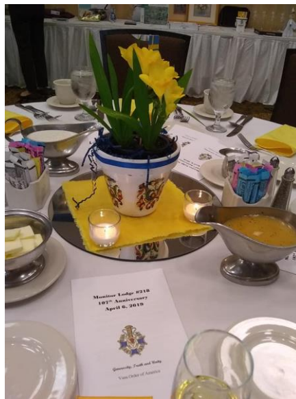
Anniversary Centerpiece - April