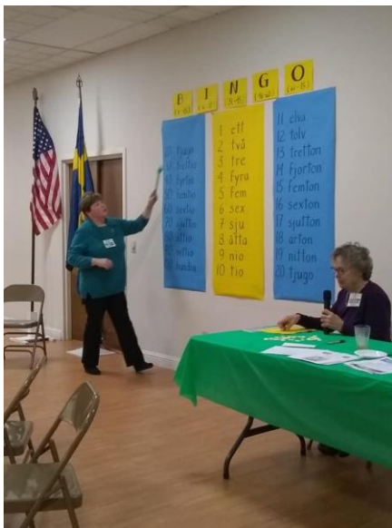
Swedish Bingo - March