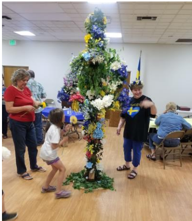
Decorating the Majstång