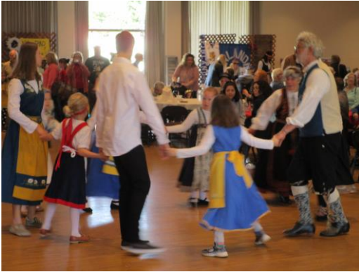
Monitor's youth dancers at Scandinavian festival