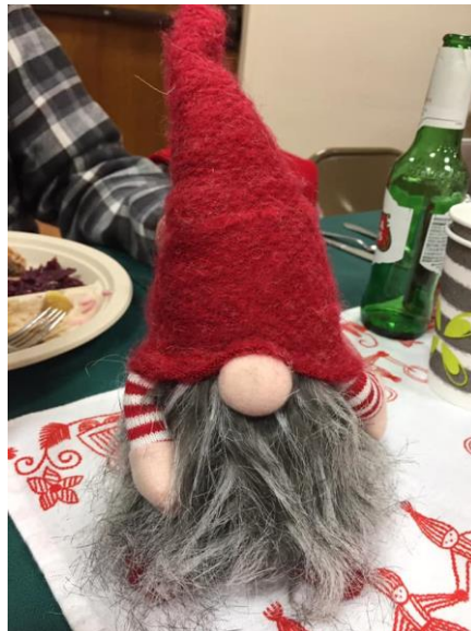
Julbord and Tomten (above)