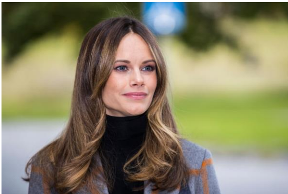
Princess Sofia of Sweden

In 2005, Sofia became known to the public when she appeared on the Swedish version of the reality show Paradise Hotel . Viewers watched as Sofia and the other contestants lived in a luxury resort together and competed to get through as many elimination rounds as possible. Sofia eventually made it to the finals. Aside from being a reality TV star, Sofia also worked as a glamour model.