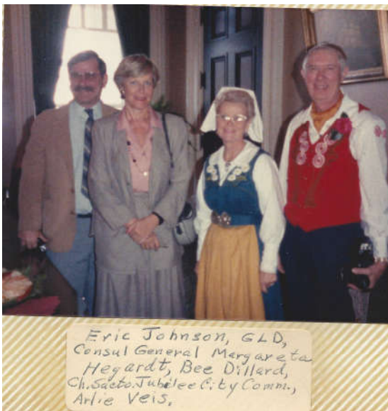
350th Jubilee of New Sweden in 1988