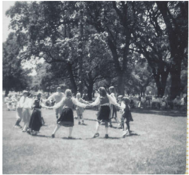
Children doing the Majstång dance 06-13-80