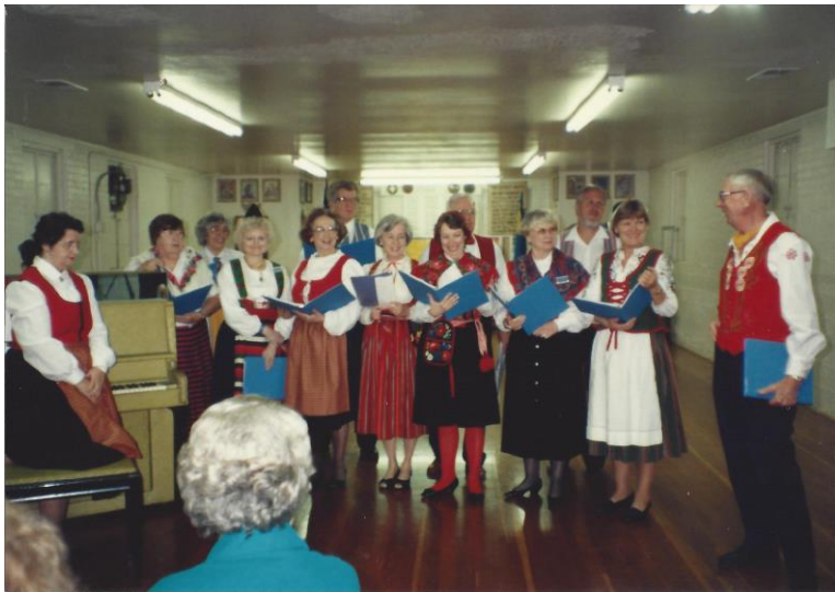
Monitor Lodge members at Sierra Kronan March 1992