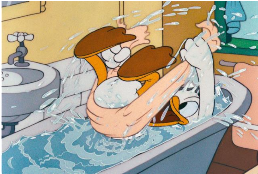
In Sweden, Donald Duck, is the face of a beloved Christmas Eve cartoon tradition.

More than 4.5 million people – almost half of Sweden's entire population – watched Donald Duck on Christmas Eve, making its 2020 incarnation Sweden's most watched TV show since modern records began.