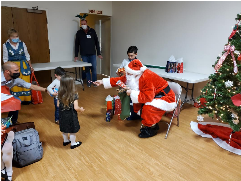
Santa and children at Monitor's St. Lucia celebration 2021