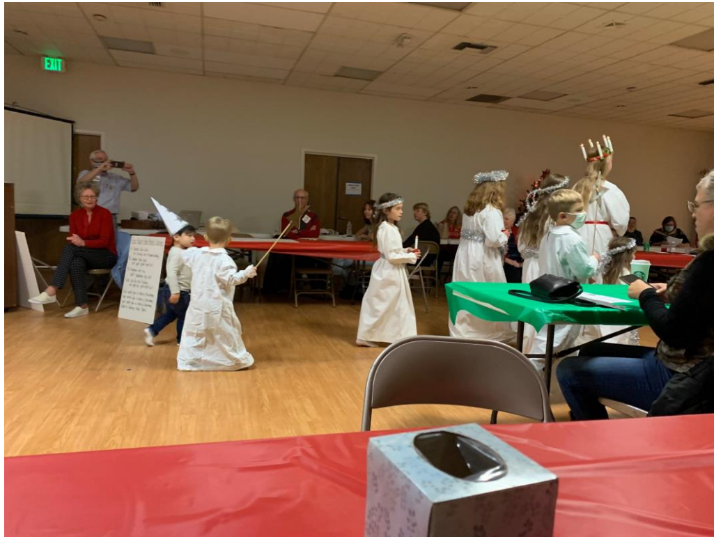
Recessional "parade" of St. Lucia and her entourage at Monitor's St. Lucia celebration