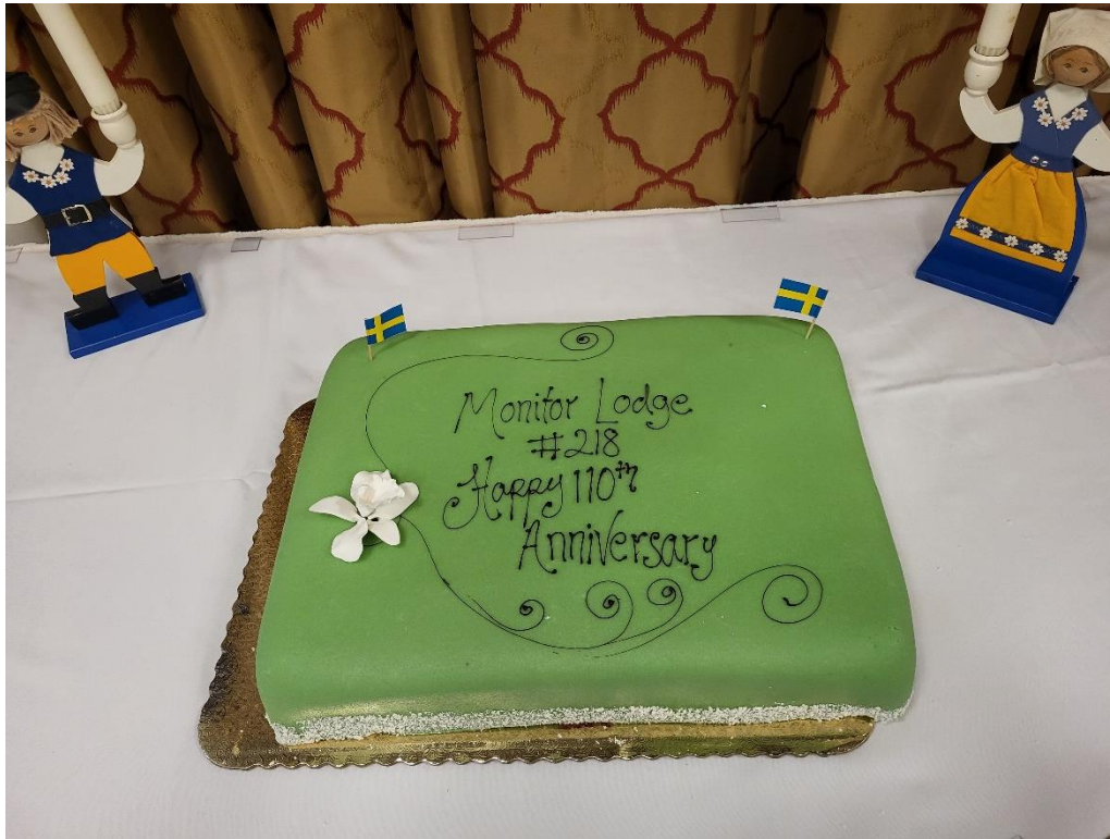
2022-04-09 – Monitor's 110 th Anniversary luncheon