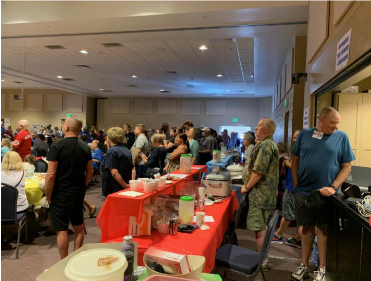
Will making sure the Saami anthem is successfully streamed during the flag ceremony (it was!)