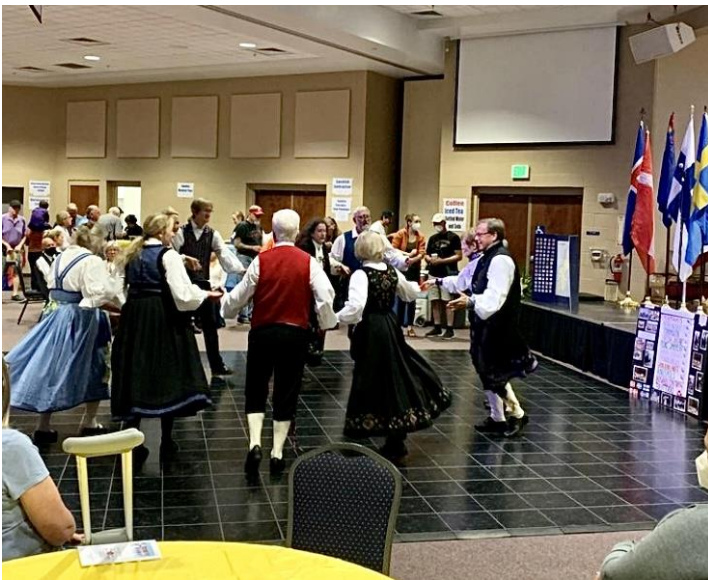
The Sacramento Area Nordic Dancers working off their pancake consumption.

And for those of you who cannot get enough of your Swedish genealogy, we've added another resource on Monitor's genealogy resources web page. It is about Augustana College offering extensive on-line Swedish genealogical research assistance .